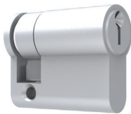
Profile Single Cylinders