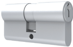
Profile Double Cylinders