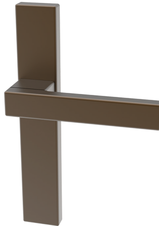
Plate Styles & Options

Recommended plate style - P1-B (38 x 220) - 38 wide minimum