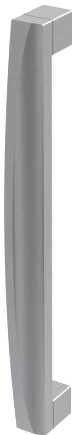
*Shown in SCPV