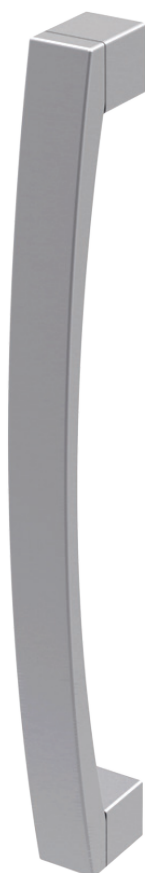
*Shown in SCPV